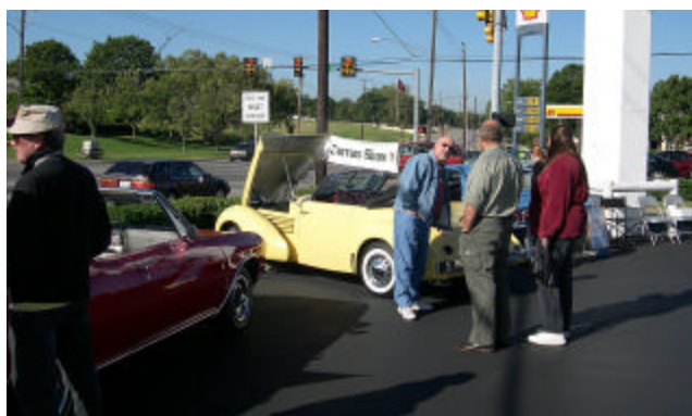
Tire kicking: Corvair Show October 8, 2005