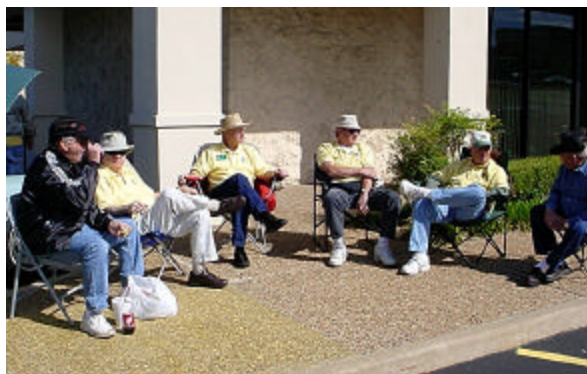
Taking it easy: Corvair Show October 8, 2005