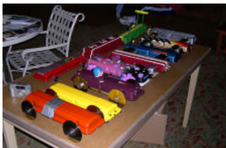
Valve Cover Race Cars