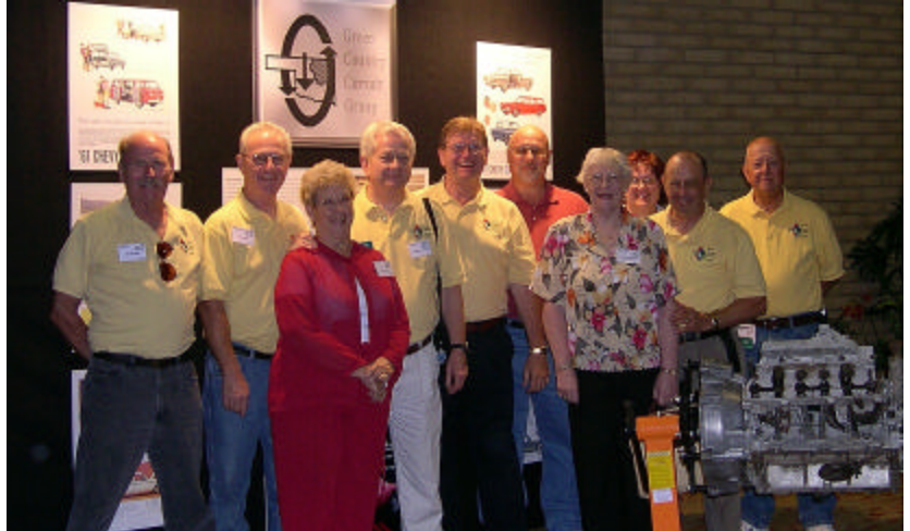
Green Country Corvair Group travelers: Great time had by all