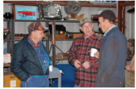
I told you it wouldn't work!