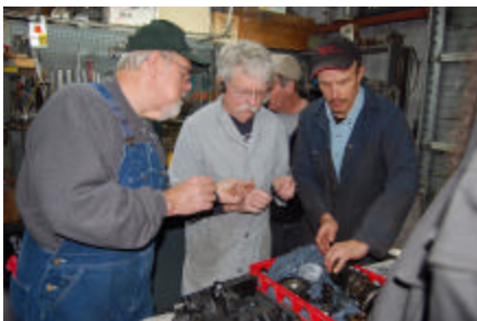
Diagnostic team at work