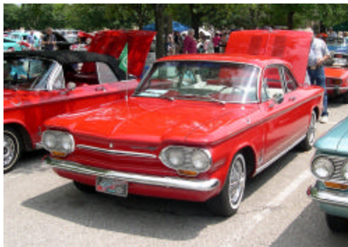
John Zink’s 63 Spyder

“My car was a ‘loaded’ 700 sedan—which means automatic transmission, tinted windshield, radio and rear view mirror. The coupes were not available, yet, on introduction day. I loved that car, in spite of the fact it replaced a 1958 Pontiac Bonneville convertible with tri-power and some 300 horses”.