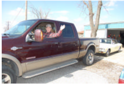
“Hybrid” Corvair: silent in tow