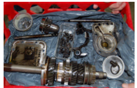
“Medical” waste? Not really