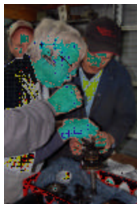
The Dr. is in!