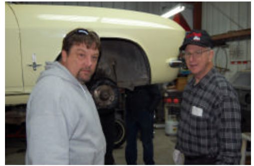
Who is making that noise?