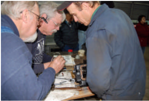
Well Doctor, will it live?