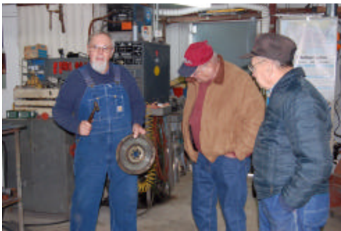
Now come to order!