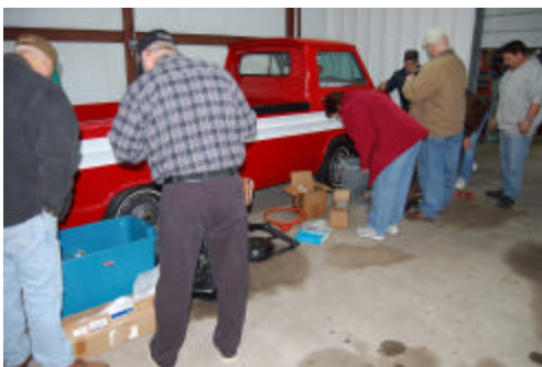
Boynton’s swap meet