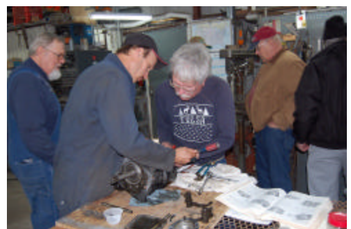
.Let’s try this.