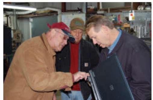
Here’s how we did it in Iowa.