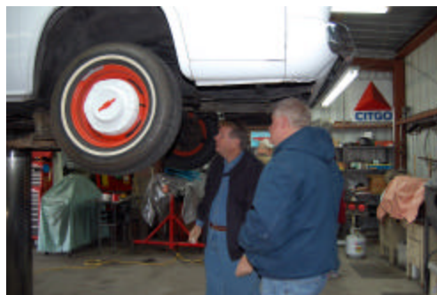
The noise came from here